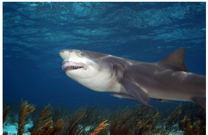
Novice 3rd Place - Mike Grueter, © 2010

These Workshops are for you and I would really like to hear from anyone with any future Workshop ideas by Clicking Here