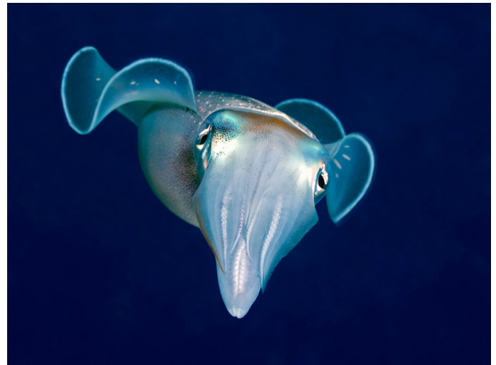
Advanced 2nd Place - Dennis Deavenport, © 2009

An image of last year's book is on the web toward the bottom of the page at http://hups.org/Gallery%20Pages/Photographer%20Gallery%20Pages.html