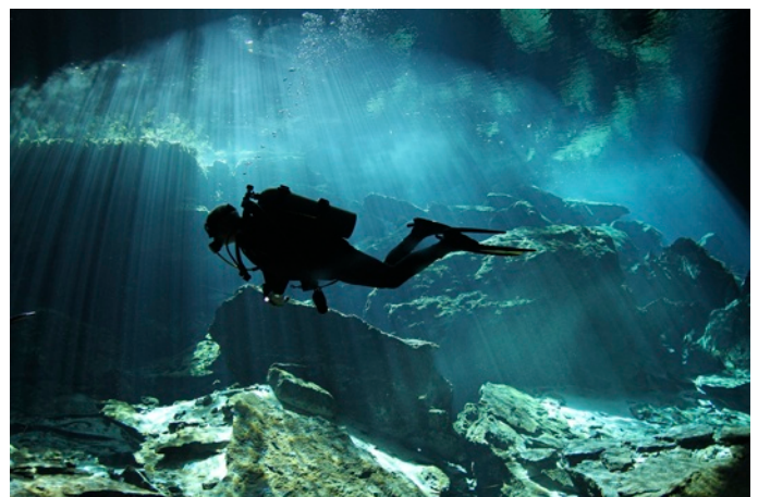
Intermediate 2nd place - Mike Greuter; © 2010

We are looking forward to another successful year in 2011 with new contestants and old stepping up to take their swings.