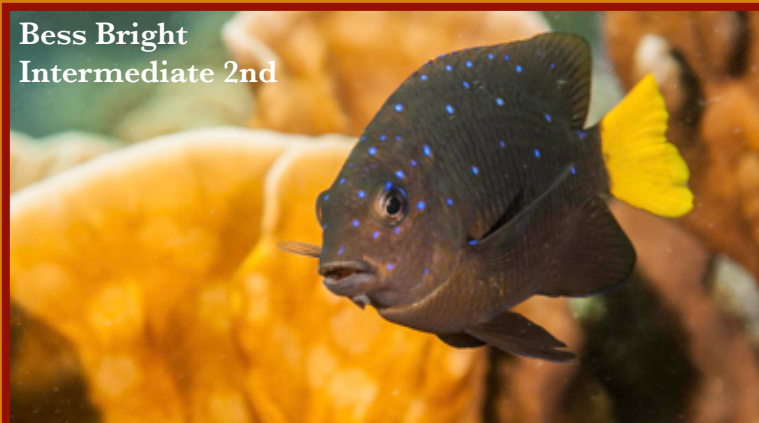
Bess Bright Intermediate 2nd