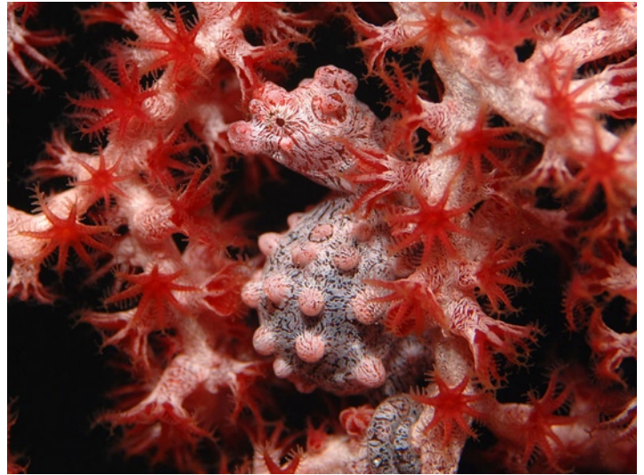
Advanced 1st place - Ken Knezick, © 2010

http://www.hups.org/Gallery%20Pages/Photographer%20Gallery%20Pages.html .