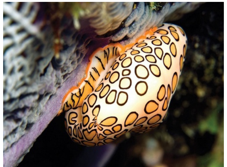
Nov ice 2nd place - Lance Glowacki, © 2010