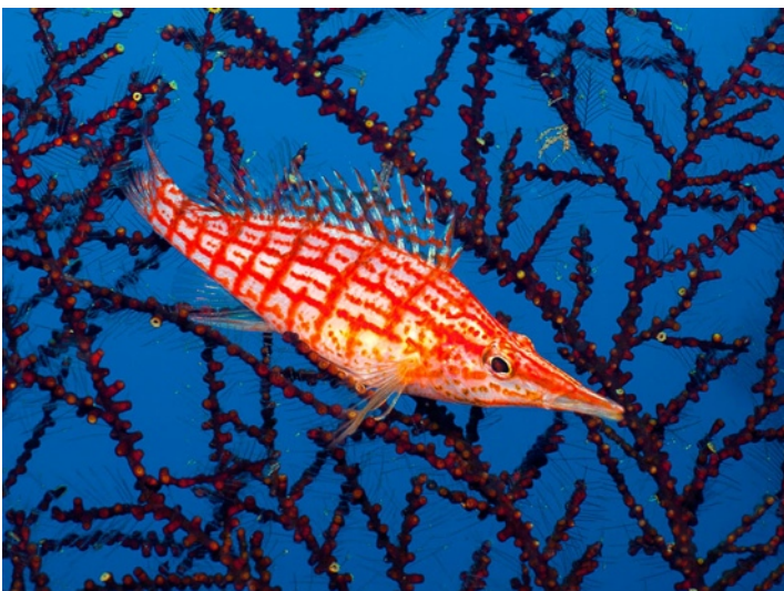
Advanced 2nd place - Jackie Reid, © 2010

http://www.thejakartaglobe.com/home/massive-coral-bleaching-diaster-hits-acehs-coral-reefs/391607 .