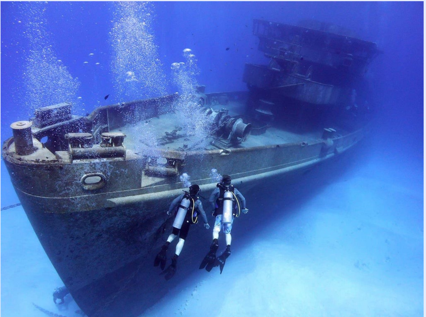
Program mode and super clear, shallow water can be a great combination for shooting wrecks. This is the Kittiwake off the coast of Grand Cayman island, before a storm knocked it over.

There is a difficult and obscure option for wrecks if you are up for a challenge: Light painting. If the visibility is good enough to see the entire wreck, you can use this cave photography trick. Go out at night and make your frame on a tripod, with settings that allow a shutter speed of over a minute. Open the shutter and swim into the scene, "painting" the wreck with a dive light, strobe, or any light source. It is possible to swim through the frame and not show up in the final image.