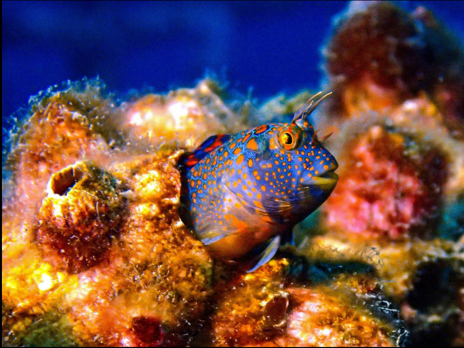
Sage Holt - Novice