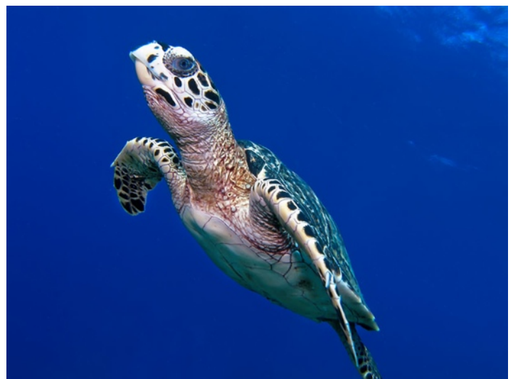
Novice 3rd place - Kandace Heimer, © 2010