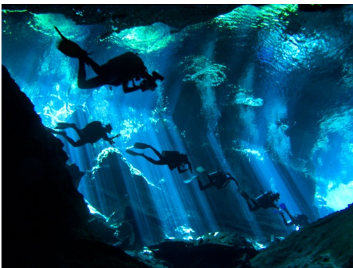
Intermediate 3rd Place - Kay Collier, © 2010