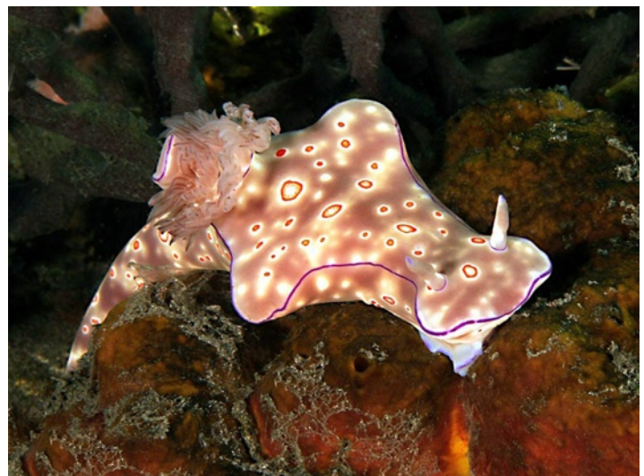
Intermediate 1st Place - Paul McDonald, © 2010