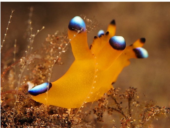
Intermediate 2nd Place - Debbie Mensay, © 2010

http://www.mvcameraclub.org/Glennie/2010/ResultsSlideShow/Awards/bestOfShow.htm