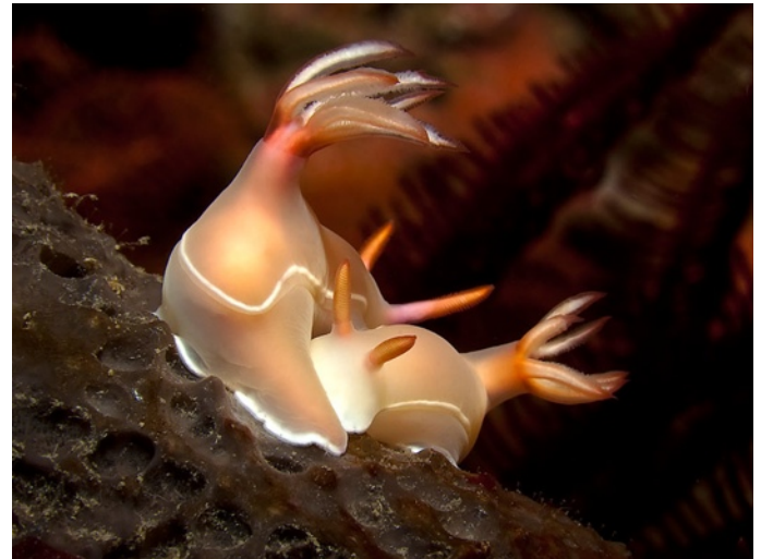
Advanced 1st Place - Tom Collier, © 2010