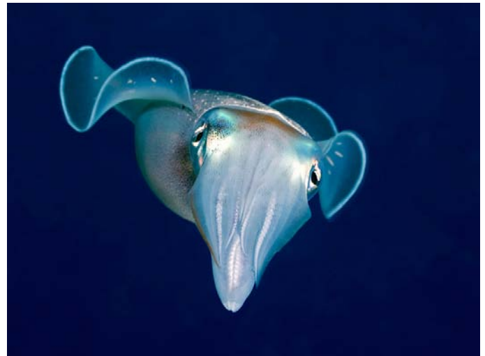
Advanced 2nd Place - Dennis Deavenport, © 2009

http://hups.org/Gallery%20Pages/Photographer%20Gallery%20Pages.html