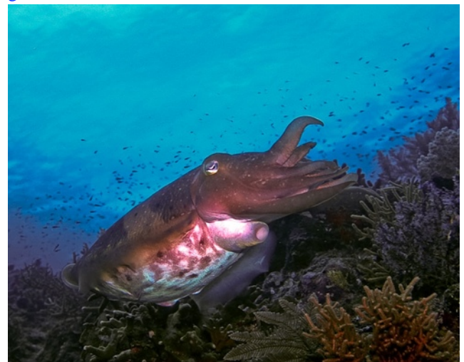
Novice 2nd Place

http://hups.org/Gallery%20Pages/Photographer%20Gallery%20Pages.html