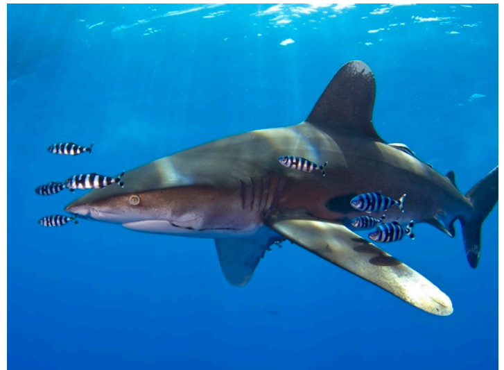
Advanced 1st Place - Tom Collier, © 2009

The HUPS newsletter is always looking for articles. If you have anything you would like to share send it to underh2o@mac.com We welcome trip reports, equipment reviews, photo tips, suggestion of underwater photography related websites, just about anything that would interest your fellow underwater photographers. Don't be shy - share!