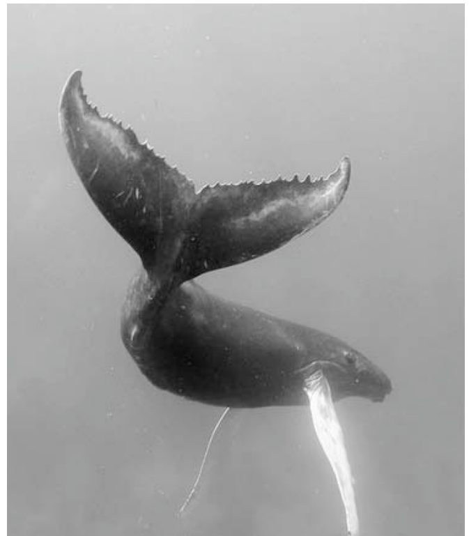
Open 3rd Place - Pat Miller, © 2009

Visible Dust Arctic Butterfly 724 Rotary Sensor Cleaning Brush with Case, (new at B&H for $109.95), in excellent condition, batteries included, for $75.00, HUPS members for $65.00.