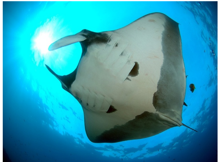
Manta

As usual our meeting will begin at 7 PM- Bayland Community Center - 6400 Bissonnet. A map can be found on the back of this newsletter.