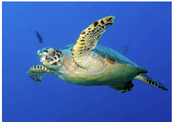
Compact Digital 3rd Place

The 2009 TGCC Banquet will be a buffet luncheon scheduled for 11am - 2pm January 31st. Awards for many area dive clubs, including HUPS, will be presented at this banquet. Twenty HUPS members have already purchased tickets to attend. It will be held at Bayland Community Center (where HUPS meets) in the main auditorium. Tickets are $10 and are available from Frank Burek - jfburek@consolidated.net .