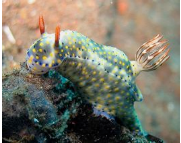
Compact Digital 1st Place (tie) - Mike Fernandez, © 2008

Where do you want to go in 2009? We are looking for suggestions for future HUPS trips.