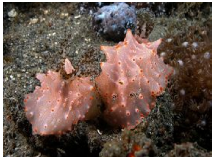
Compact Digital 2nd place (tie)

6723 Imperial Leaf Lane Spring, TX 77379