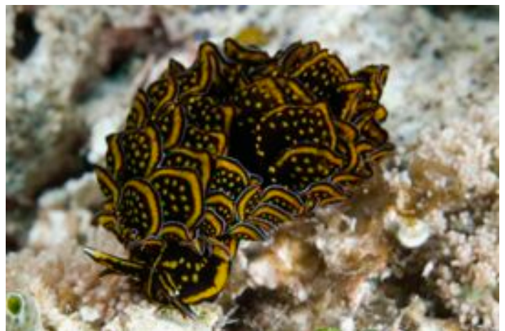
Novice 1st place - Tracy Bennett, © 2008

Starting with the January 2008 contest, HUPS is sponsoring a new contest category for images taken with Compact Digital cameras. The rules are the same as for the Novice and Advanced categories with the exception that only images taken with cameras having fixed primary lenses will be accepted for judging. So, all you guys who have been shy about entering because you don't have a DSLR, this is your chance. You will be competing on even ground with other compact digital shooters. Don't be shy. You can't win if you don't enter!