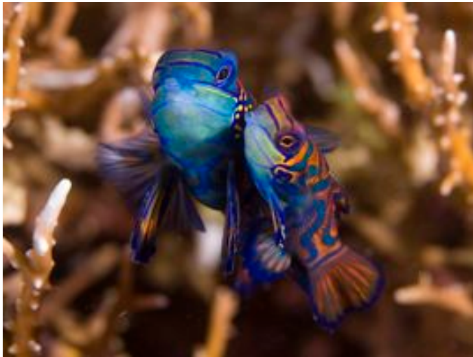
Novice 1st Place - Patricia Linn, © 2008

August - Bird Fish (fish named after birds - parrot, cardinal, hawkfish ...)