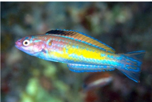
Halichoeres burekae