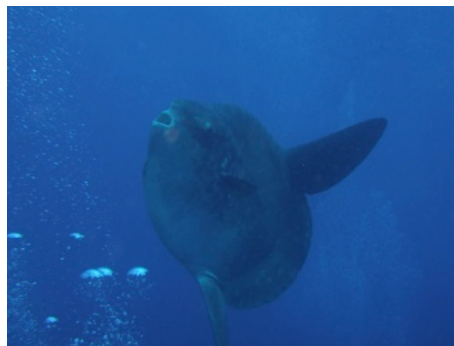
Mola Mola