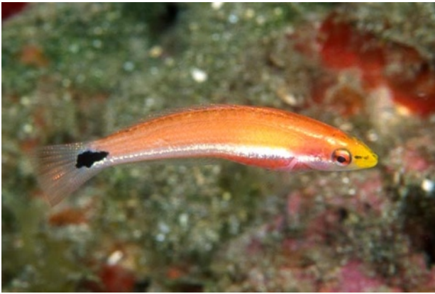
Halichoeres burekae