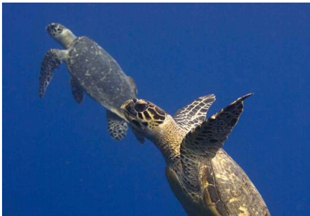
Turtle image by Kimberly Dietz, © 2007

Contact me for more information: tom@tpixs.com