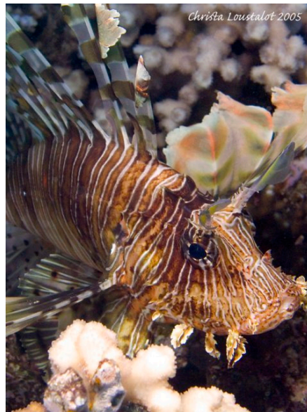
Lionfish