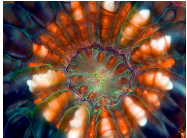
1st Place Advanced Digital - Mary Lou ReidReid, © 2006

Last year we only had one digital division for our monthly contests. All levels of photographer were lumped into that one division. We had many novice photographers complain that we didn't have a separate novice category. For 2006 we are now offering a novice division. The only problem is that we are getting very few entries. We have had a couple months where only one person entered the Novice division. What's the problem? Are you shy? Don't have anything suitable for the topics? We really do want more participation in the Novice contest. Start looking at the contest subjects and pick out some images to enter. How can you win if you don't enter?