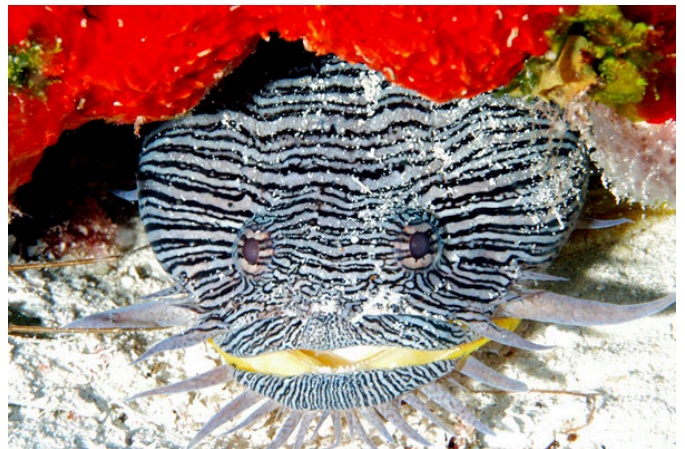
Novice Digital 3rd Place Sheree Fields, © 2006.

http://www.motherjones.com/news/feature/2006/03/the_fate_of_the_ocean.html