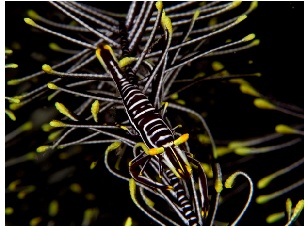
Novice Digital 2nd Place Sarah Bernhardt